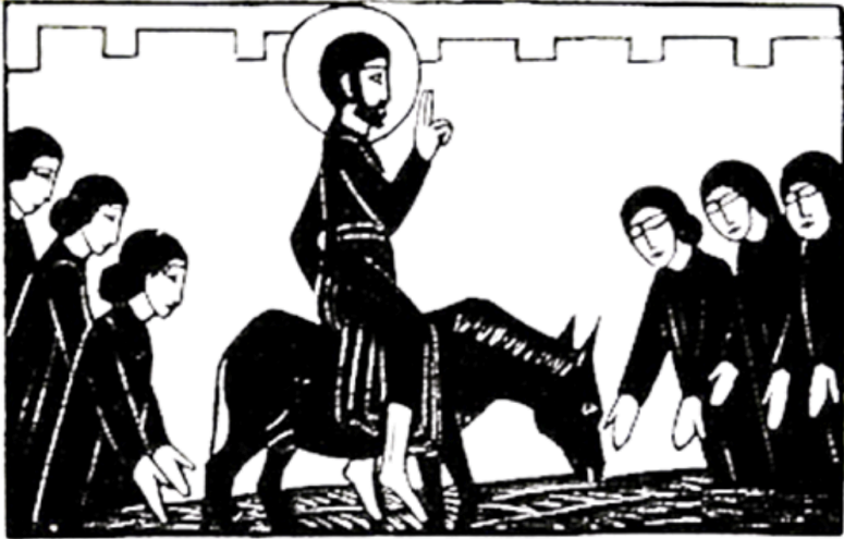
Eric Gill, Wood Engraving, Palm Sunday National Galleries of Scotland collection.

ST. ANDREW'S EPISCOPAL CHURCH 5801 HAMPTON STREET 412-661-1245 WWW.STANDREWSPGH.ORG