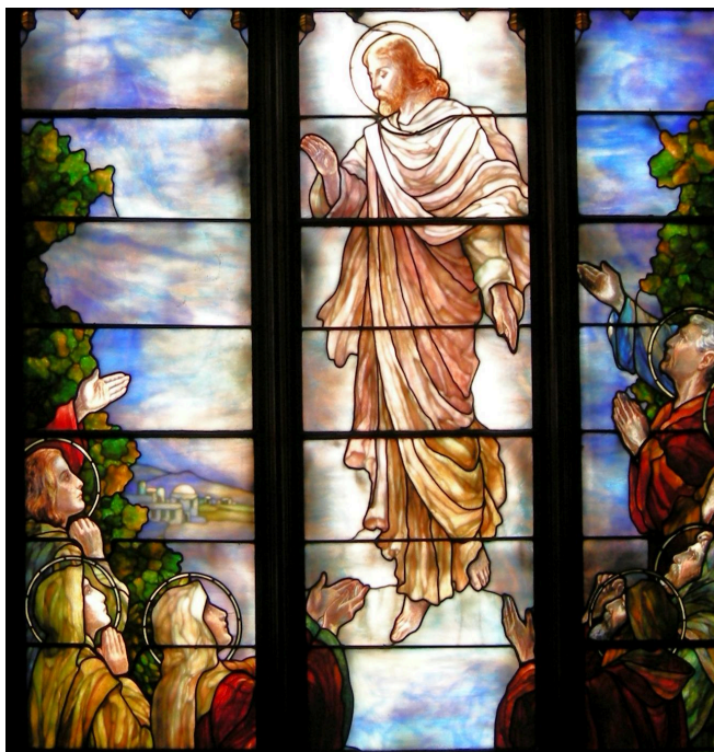
St. Andrew's West Transept Window: The Ascension

ST. ANDREW'S EPISCOPAL CHURCH 5801 HAMPTON STREET 412-661-1245 WWW.STANDREWSPGH.ORG