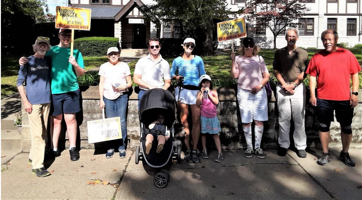
2021 CROP Walk Team

This year, St. Andrew's will rejoin the Pittsburgh East walkers in the walk of up to 6 miles through the East End to publicize the continued need to address hunger, locally and internationally, and to raise money for hunger initiatives. (Note that many walkers choose to customize their walk for a shorter distance of 1-3 miles). The walk starts at 2 pm at the South Ave. Methodist Church in Wilkinsburg.